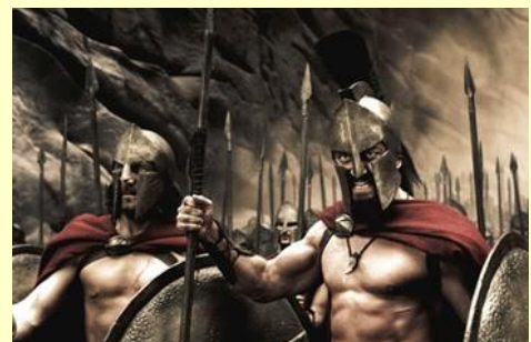
The 300 Workout !